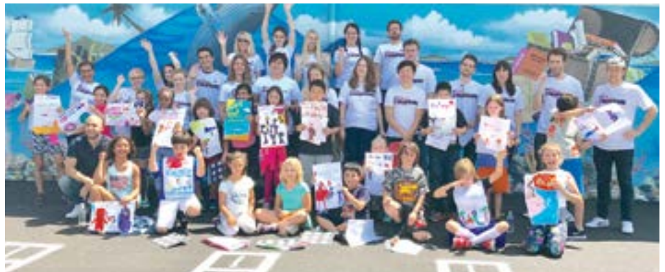
Stevenson fourth-graders with their program mentors.

The Stevenson staff and community are extremely thankful for this partnership. These programs encourage students to share a story, validate their words, and develop confidence. We are looking forward to starting our "Script to Stage" program this month. To find out more about Young Storytellers you can go to https://www.youngstorytellers.com/