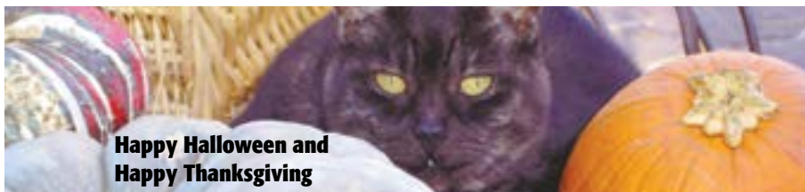
Happy Halloween and Happy Thanksgiving