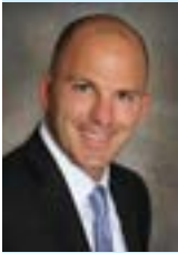
Matt Hill Superintendent

Due to the generous support of Burbank voters, our schools continue to receive much needed upgrades. This past year we sold the last issuance of bonds for the $110 million Measure "S" election of 2013. The Series C bonds are expected to have an average interest rate of 3.59%. Most important is the fact that the District will be able to maintain a maximum tax rate of $55.18 (per $100,000 of assessed property value) on all of its outstanding school bonds, as promised.