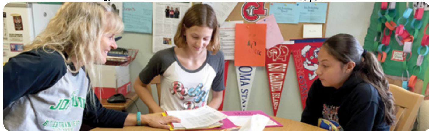
Focused On Student Success