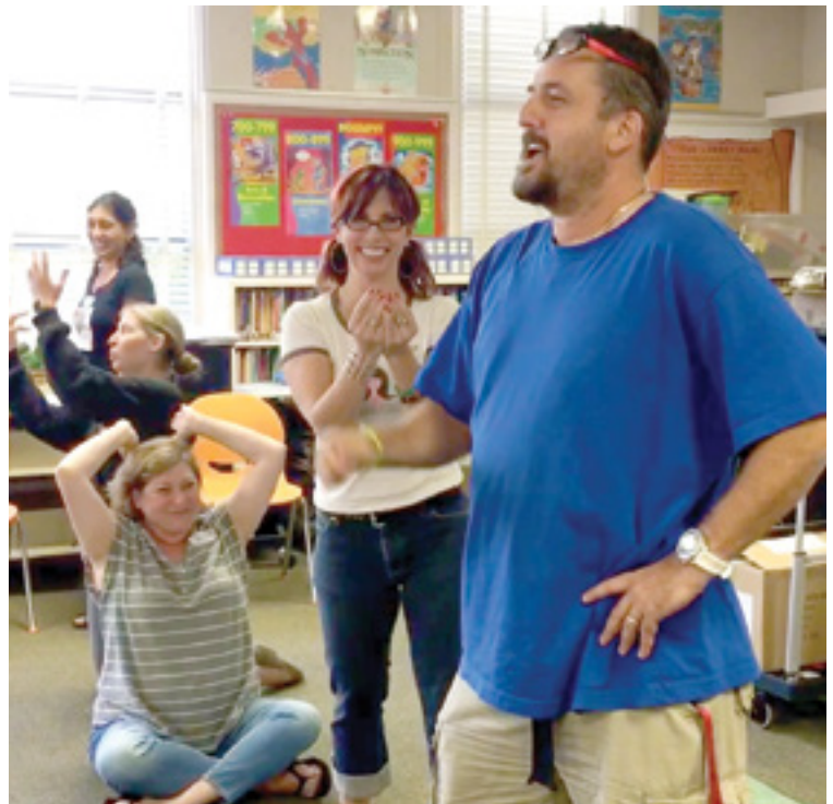
Teachers during our Drama Works professional development day.

The staff and families at Robert Louis Stevenson Elementary School are proud of our mission of strong academics and strong arts and technology programs. And becoming a California Gold Ribbon and Exemplary Arts School this past year was certainly a highlight. Integrating the arts within the core curriculum contributed to our high SBAC scores. These test scores are a true testament to our dedicated teachers and supportive parents. This year we are focusing on drama, using techniques such as depth and complexity icons and focusing on the big idea, Growth Mindset, and Guided Language Acquisition Design (GLAD). Our very generous PTA and booster club, Families for Stevenson (FFS) support many of these programs. The Stevenson Boo Bash is our big PTA fundraiser. It has become a large community event enjoyed not only by our school families but by Burbank residents as well. Our FFS holds a similar event in the spring called Stevenson Rocks. We are truly thankful for the support of both of these parent organizations.